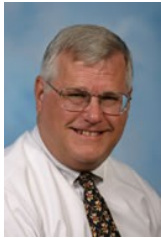
Headmaster Christian Academy